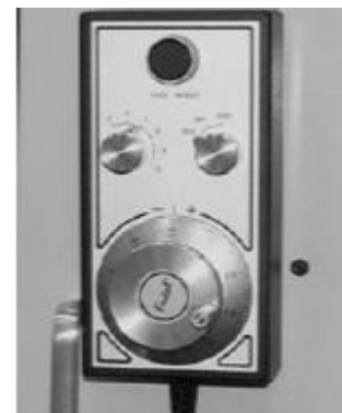
Figure 3-1 Optional manual pulse generator remote.

WARNING: When using the keyboard to jog. The increment and axis selection at the keyboard will override the current settings of the selector switches. When going from the keyboard to the manual pulse generator for jogging, move both selector switches and confirm they are selected by looking in the lower left portion of the screen to see the active Jog mode status.