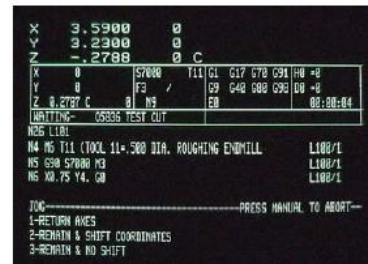
Figure 3-5 "Waiting stage" options menu.

The control will prompt the operator with the message shown in figure 3-5.