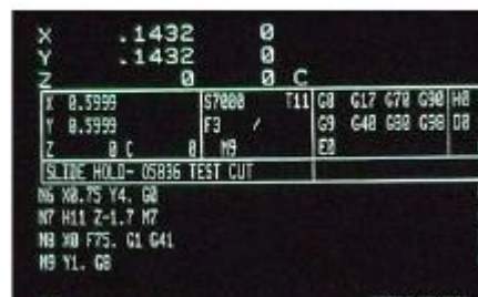
Figure 3-4 Options for manual slide hold.

Option 2 will cause the tool to remain at this current position, the tool coordinate system will be shifted to this position, and execution of the program will continue.