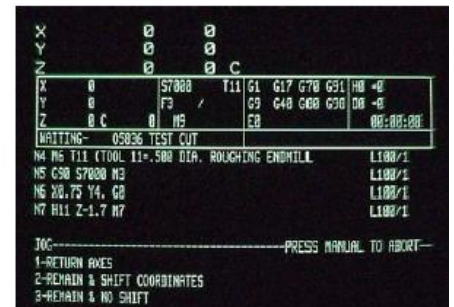
Figure 3-3 Screen display after pressing JOG button.

Option 1 will cause the tool to return to the place where the JOG key was originally pressed. This movement will be at 150 inches per minute, moving the x-axis first, the y, a, and b-axes next, and the z-axis last. The control will then be ready to execute the next line in the program.