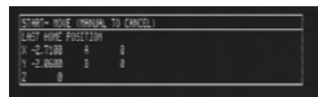
Figure 1-8 Last Home Position screen.