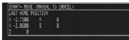
Figure 1-11 Last home position.