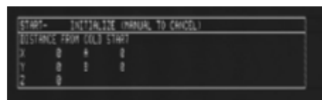
Figure 1-7 Power-on screen display.