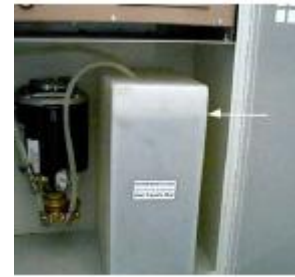
Figure 1-4 Spindle cooler reservoir.