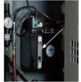
Figure 1-1 Oil reservoir and sightglass.