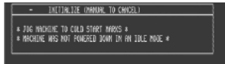
Figure 1-9 Screen display when VMC is improperly powered off.

If the VMC was improperly powered off, the wrong power off screen, shown in Figure 1-9, will display.