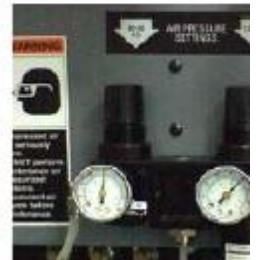
Figure 1-2 Air pressure gauges.