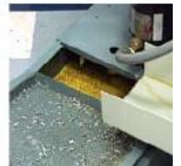
Figure 1-3 Coolant tank 1 level.