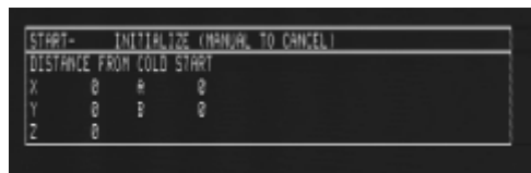
Figure 1-6 Screen display following power-on.

The Fadal logo will display on the monitor screen of the pendant when the VMC is powered on (See Figure 1-6).