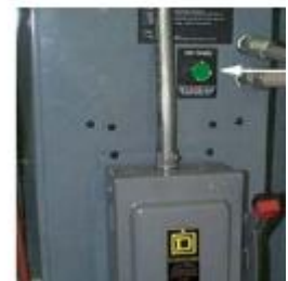
Figure 1-5 Main power box and green power button.